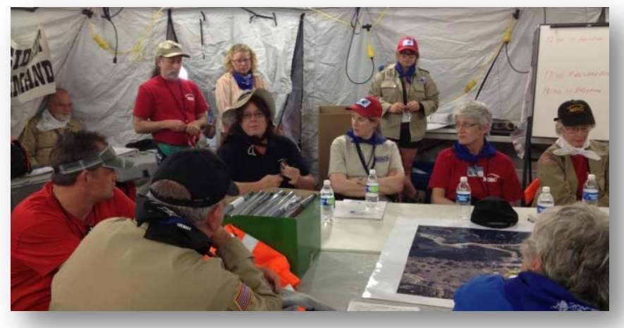
Volunteers above are participating in field training at the Austere Medical Exercise in Ventura

A Volunteer Code of Conduct is provided on p. 23 in this Volunteer Handbook. This code does not preempt or preclude local MRCs or other units from establishing additional expectations or conduct codes for DHVs or MRC members.