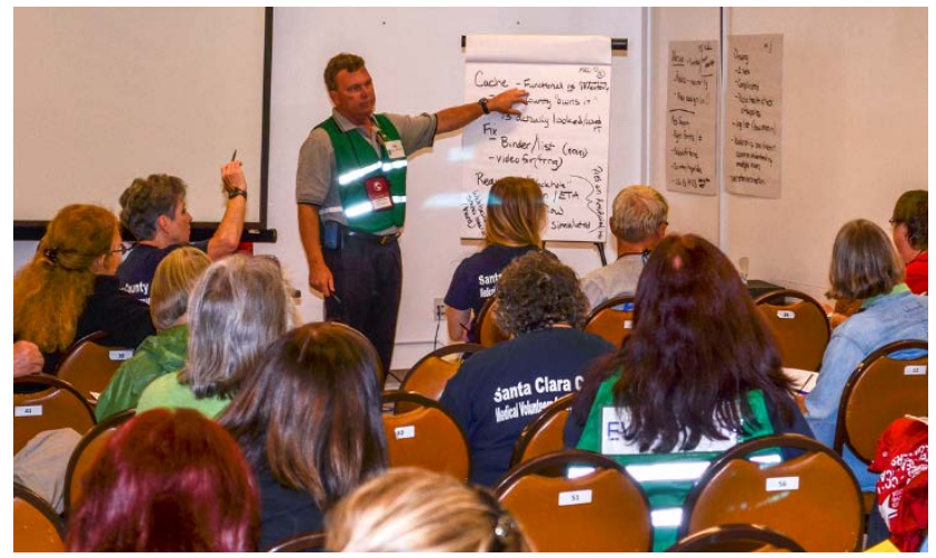
Volunteers debriefing at EMSA's Golden Guardian Field Exercise

Consider having a personal family disaster plan in place. Personal medical conditions may need to be evaluated. Consider the safety and well-being of your family if you respond. Emergency response can be physically and emotionally difficult.