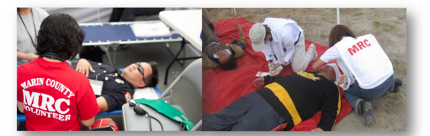
Volunteers above are practicing patient triage during an exercise in the Oakland Coliseum

By registering and agreeing to these Terms of Service, I agree that the information I provide and the representations I make at this Site will be truthful, complete, accurate, and free of any attempt to mislead. I understand that I may return to this Site and modify my personal information at any time, and I agree to keep such information updated and current. I agree to protect the confidentiality of the password I have chosen that provides access to my information on this Site, and I agree to abide by all security provisions of this Site.