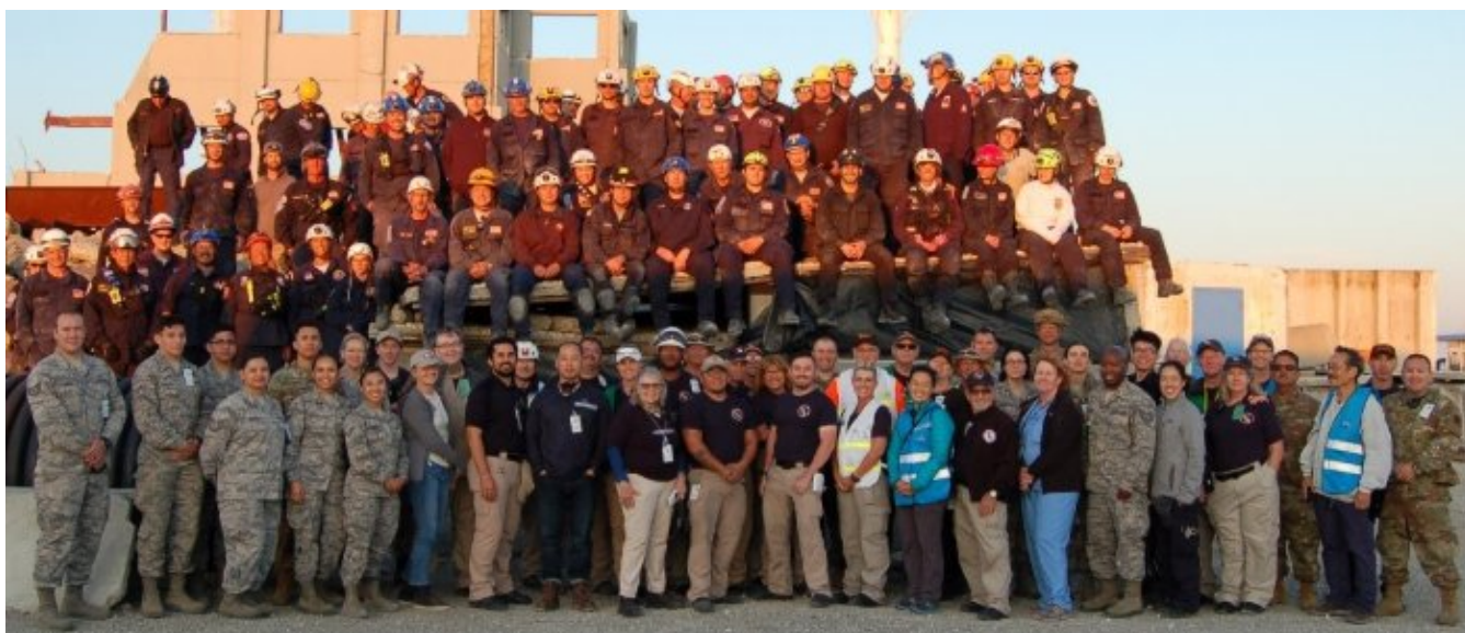
Participants of the CAL-MAT Field Training Exercise

The Urban Search and Rescue (USAR) teams from around the country acted as first responders providing lifesaving interventions and patient handoff to the medical receivers. CAL-MAT, Medical Reserve Corps (MRC), and California Air National Guard (CANG) personnel received the patients from USAR and performed trauma triage assessments, stabilization procedures, and facilitated emergency transport.