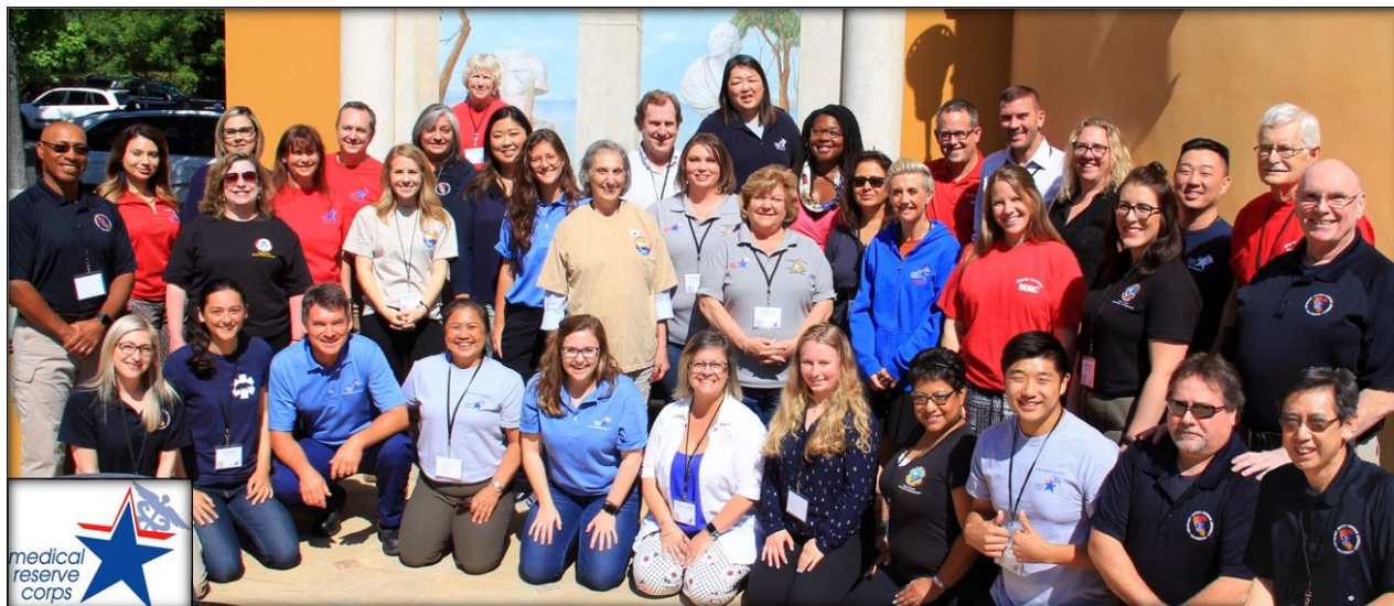
Pictured above are MRC unit coordinators, the Region IX MRC Coordinator, and EMSA staff