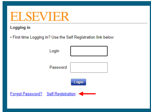
Figure 1. Login Screen, Arrow, Self Registration link.