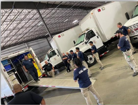
EMSA Station 4 Warehouse – CAL-MAT Members receiving response vehicle overview before heading to the Electra fire.

The California Medical Assistant Teams (CAL-MAT) is a paid program within the Emergency Medical Services Authority under ESF 8, which provides medical support across the State of California. There are currently 9 CAL-MAT units that prepare and respond to natural disasters such as wildfires, earthquakes, floods, and other emergencies like the COVID-19 pandemic and terrorist attacks. During a disaster, members can deploy for a minimum of one week at various locations across the State. CAL-MAT units consist of members who are in a geographical area to which they reside. Unit members typically meet a few times a year at the discretion of the Unit Leader. The Units also include non-medical personnel to provide logistics and administrative support consistent with the Incident Command System. Communications for CAL-MAT disaster deployments go through the Disaster Healthcare Volunteers (DHV) System.